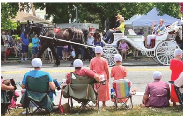
Middlebury Summer Festival

7-11 a.m., East Park Pavilion. Sponsored by First United Methodist Church. SOS group $. Proceeds will be donated to local cause.