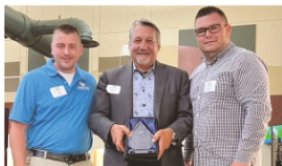
Chamber Annual Dinner